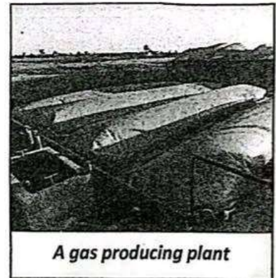
A gas producing plant